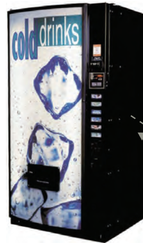
Key light stays on for 5 secs.

Point the key at the vendor 1-3" from receiver and press the center button on key