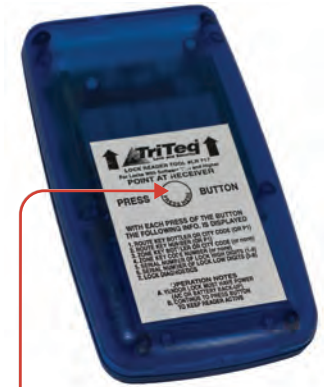
Lock Reader P/N LR717

Press button. Each press advances the diagnostics as described in the adjacent table.