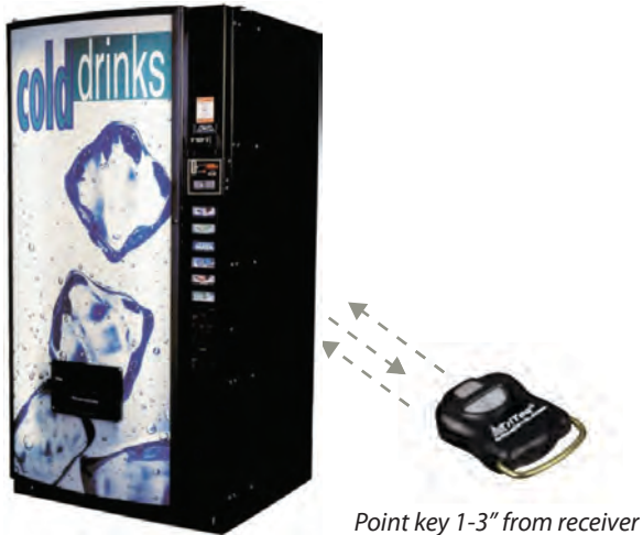
Point key 1-3" from receiver